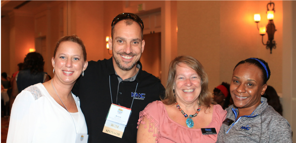
Thank you to Kirkpatrick Management Company for sponsoring the hotel key cards.