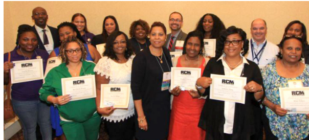
Newly certified RCMs proudly show their certificates.