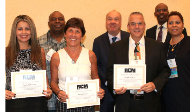
Re-certified RCMs show off their certificates.