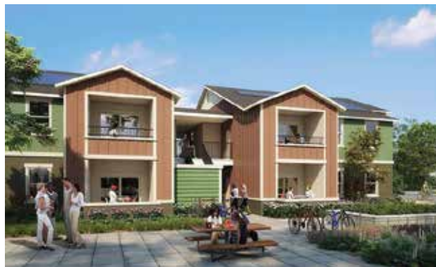
This is a rendering of phase two of Mutual Housing at Spring Lake when construction is completed.