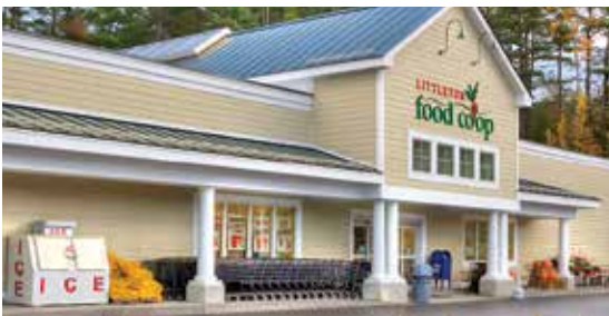
The Littleton Food Co-op, located in Littleton, N. H., opened in 2009 and is a 13,500 square-foot store.

Currently, NHCLF manages over $120 million in assets including a loan portfolio of over $100 million. NHCLF was one of the first Community Development Financial Institutions in the United States and has received the highest honor in its field, the Wachovia NEXT Award for Opportunity Finance. The NHCLF formula has been so successful that it spun off ROC-USA (see https://rocusa.org ) to carry out cooperative conversions throughout the nation. However, in New Hampshire, CCF and NHCLF