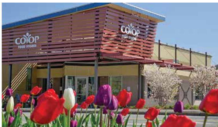
Hanover Food Co-op in Hanover, N.H., neighbors Dartmouth College.

On its part, TPCF invests the joint endowment funds only in cooperative development organizations or in cooperatives. The full $3.5 million in TPCF/CCF funds are invested only within the family of cooperatives and at 12 to 1 leverages