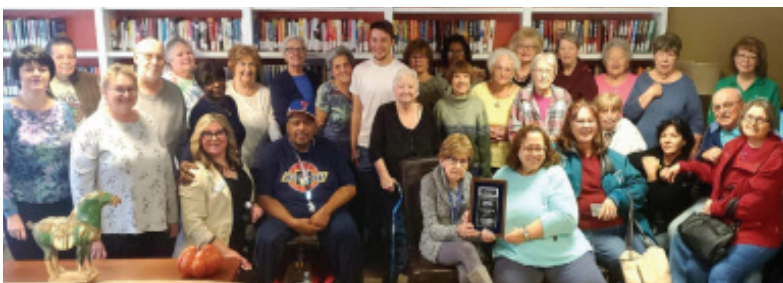
Members of Barton Towers Co-op in Royal Oak, Mich., proudly showcase its Cooperative Star Award.

The award recognizes individuals or cooperatives that demonstrate excellence in the development of new cooperatives or the preservation of existing ones. While in the past the award has focused on construction and