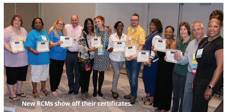
New RCMs show off their certificates.