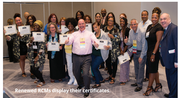
Renewed RCMs display their certificates.