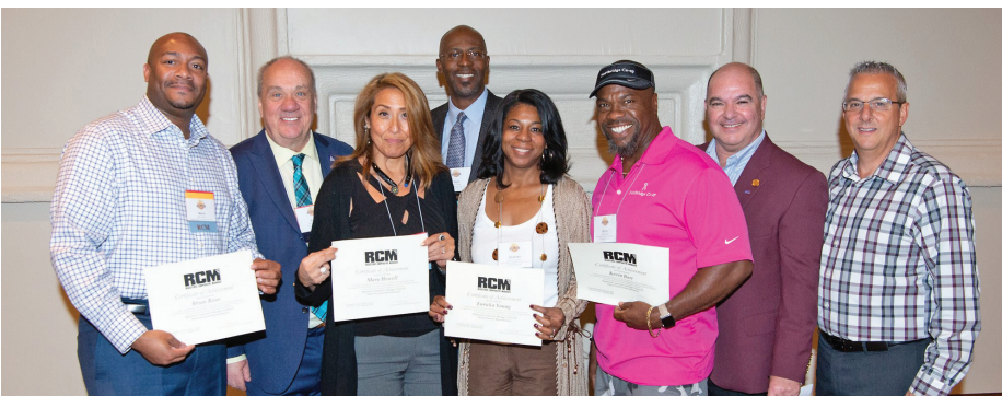
New RCMS show off their certificates. Right: Renewed RCMs display their certificates.