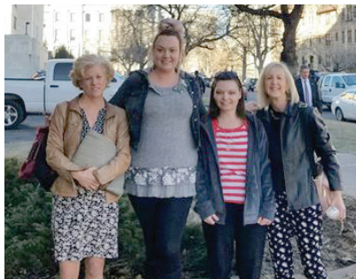
Rocky Mountain Board Members and Thistle Staff went to the Colorado Housing Board in Denver, where they were

RMHC is the 228th ROC in the ROC USA network, which is made up of more than 14,700 homeowners nationwide. CHQ