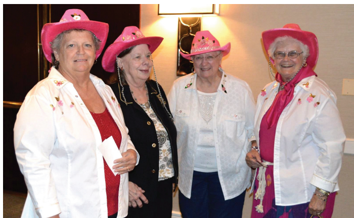
CSI members to Saddle Up for the Co-op Rodeo in Troy, Mich.

IN AUGUST , hundreds of members traveled to their respective CSI management conferences in Boston, Mass.; Annapolis, Md.; City of Industry, Calif.; and Troy, Mich. MI, to Saddle Up for the Co-op Rodeo! Members who are willing to saddle up by learning new things and helping their cooperatives be the best they can be attended this educational event.