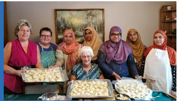
Members of the Sarcee Meadows Women's Circle prepare perogies for a potluck.

a powerful example of what can happen when cooperators share good news stories. In 2014, six women in the cooperative sat down with their community's social worker to learn about each other's cultures. In the years since, the group has worked to bridge divides in its community, organize cultural events, volunteer with local organizations, build community and support each other through difficult times. The group shared its story in 2017 and garnered a national Canadian cooperative award for its work. Since then, the group has received international media coverage from the United Kingdom, the United States, Europe and India and have gone on to inspire countless others with its story.