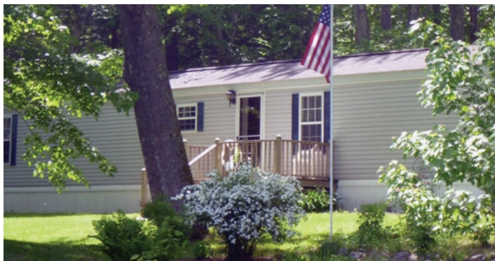
Wardtown Mobile Home Park is a community of 60 spacious mobile home sites in rural Freeport.

THE RESIDENTS OF WARDTOWN MOBILE HOME PARK in Freeport, Maine have become the 6th Resident Owned Community in the state. Residents of the community worked for nine months with assistance from the Cooperative Development Institute. Genesis Community Loan Fund and the Maine State Housing Authority provided financing for the purchase and infrastructure improvements for the 60-unit co-op.