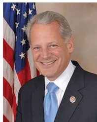
Rep. Steve Israel

On April 15th, Rep. Steve Israel (D-NY) and Rep. Jerry Nadler (D-NY) successfully amended H.R. 1471, the FEMA Disaster Assistance Reform Act of 2015, to help housing cooperatives receive federal disaster benefits. The amendment, made during a House Transportation and Infrastructure Committee meeting on H.R. 1471, directs FEMA to develop policy solutions so cooperative shareholders are able to use assistance to repair storm damage to common areas.