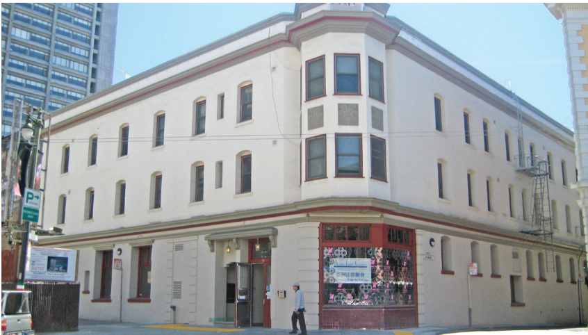
Columbus United Cooperative is a 21-unit limited equity housing cooperative based in San Francisco.

This model has been adopted by the Oakland CLT in its new program to create low-income affordable homeownership. Assisted by SFCLT and BACLT, OakCLT has conducted a series of community meetings to build support, and numerous community-based organizations have signed on as endorsers. Oakland is a rapidly gentrifying community with many people moving to the city from San Francisco where a one-