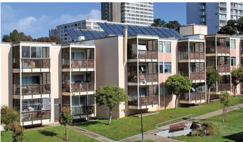
St. Francis Square is a 299-unit apartment housing cooperative in San Francisco.

Over the past 15 years, HIT has helped to preserve the affordability of more than 12,660 cooperative housing units at a number of New