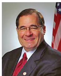
Rep. Jerry Nadler

The law authorizing federal disaster relief, called the Stafford Act, does not include a definition of housing cooperatives. This ambiguity has led to significant confusion about the eligibility for assistance and made it nearly impossible for residents of cooperatives to make the common areas of their buildings habitable or to repair living quarters. Restrictive interpretations by FEMA paint cooperatives as for-profit commercial rental buildings.