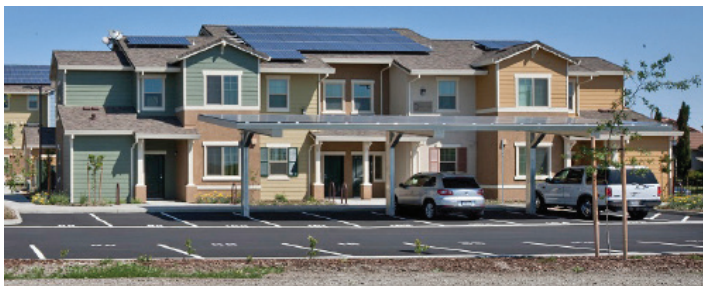
The development at Spring Lake is the first multifamily community to be certified under the DOE Zero Energy Ready Home program.

Founded in 1988, Mutual Housing California develops, operates and advocates for sustainable affordable housing. Mutual Housing has more than 3,000 residents, nearly half of whom are children. CHB