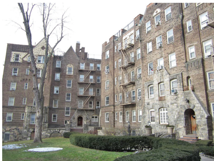
The Amalgamated with 1,482 apartments is located in New York City.

No matter, these union-sponsored-housing cooperatives were one of the few housing models that provided a low-cost first step into homeownership and gave low and moderate income union households access to tax deductions just like all American homeowners. These union-sponsored housing cooperatives provided homeownership to many low income and multiethnic and multiracial families who without the cooperative opportunity