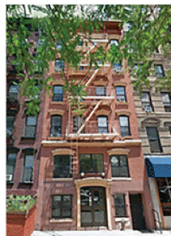
The Cooper Square Mutual Housing Association offers East Village co-ops via lottery.