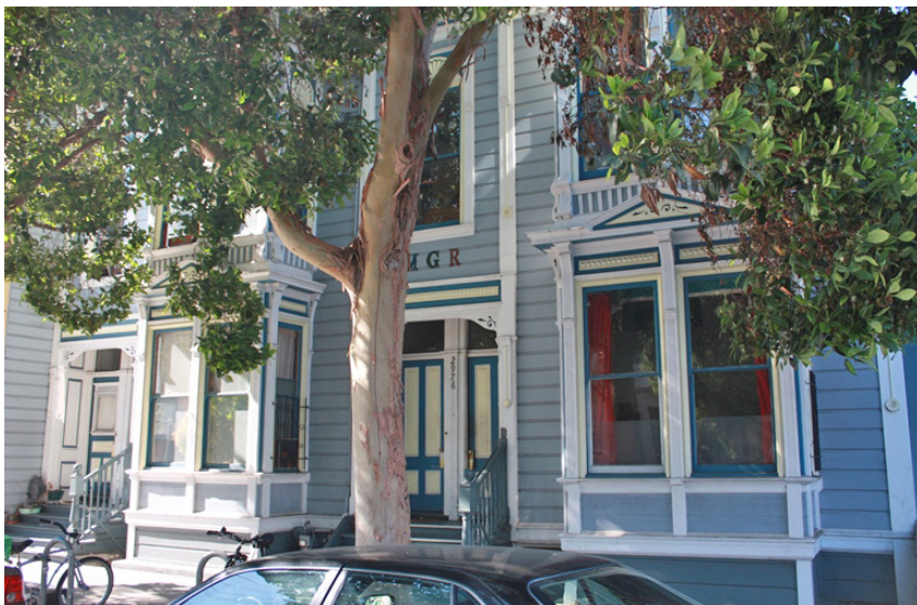
The residents of 2976 23rd Street are now cooperative members.