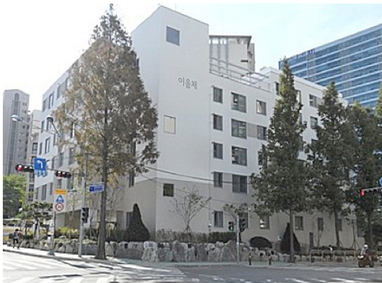
The Ieumchae building, a public housing cooperative.

SOUTH KOREA welcomed its first in a series of public housing cooperatives at an event in Seoul on November 23, 2014. The public cooperatives are part of Seoul Mayor Park Won-soon's plan to provide 80,000 units of housing, a pledge he made in his campaign for reelection. Instead of the typical approach of building the apartment first and then finding occupants, the new approach has like-minded prospective tenants coming together to form a cooperative that directs the entire process from planning to construction, naming, and even design.