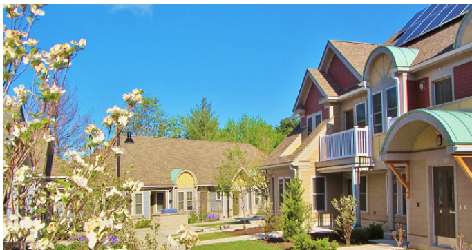
In November 2010, 39 previously homeless veterans moved into the Gordon Mansfield Veterans Community in Pittsfield, Mass., the first ever cooperative for homeless veterans in the U.S.