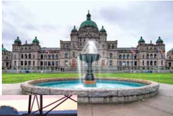
Right: Parliament building in British Columbia Below: Seattle's Pike Place Market

LET US LEARN —Attendees can choose from six tracks of classes on Thursday, October 31 and Friday, November 1, 2103. The tracks include financial considerations for cooperatives, including a class on the mortgage pay off; cooperative planning and marketing, presented by a representative of Canadian Housing Federation – The Real Story – Rooftops Canada; legal and legislative issues, involving lobbying as well; improving operations,