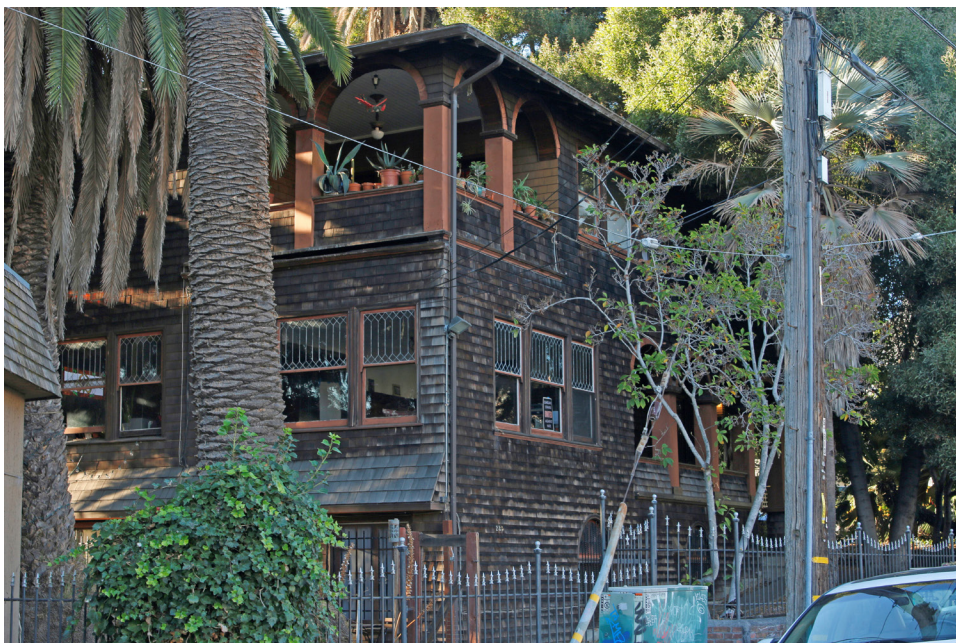
Newton House is a large duplex that provides housing for nine adults.

BACLt helped introduce a small sites program in Berkeley, which targets 5- to 25-unit buildings and gives priority to housing cooperatives developed by CLTs. The city council approved the program, and it will be launched soon. BACLt also has two current projects that may receive "small sites" funding.