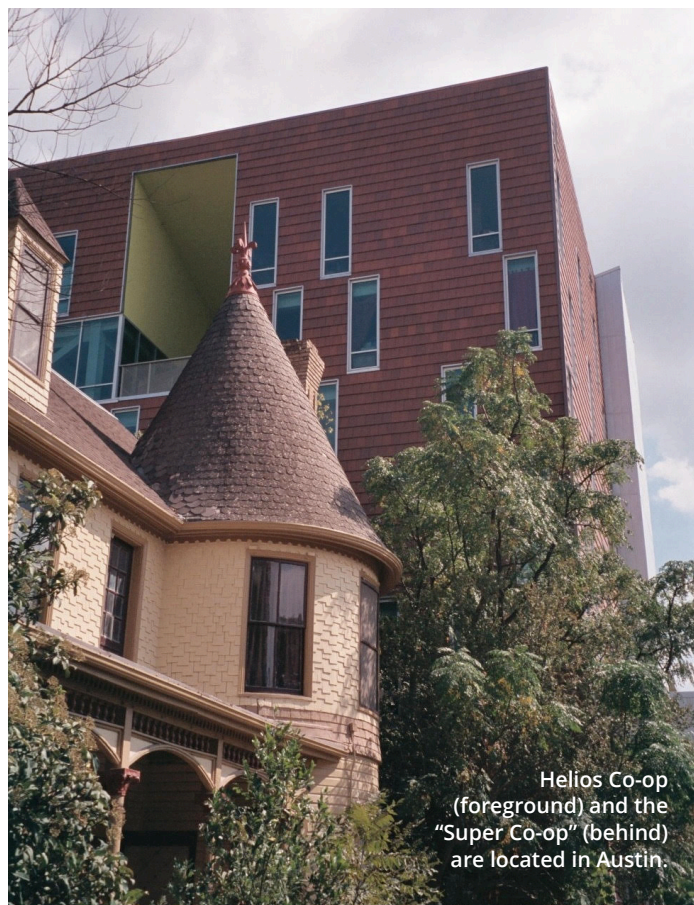
Helios Co-op (foreground) and the “Super Co-op” (behind) are located in Austin.

2. SHARED WORK. “Sweat equity” not only lowers costs, but it also gives people a stake in the success of their homes. From sweeping floors and changing lightbulbs to buying food for dinner or calling contractors to fix the leaking roof, everyone does their part in keeping