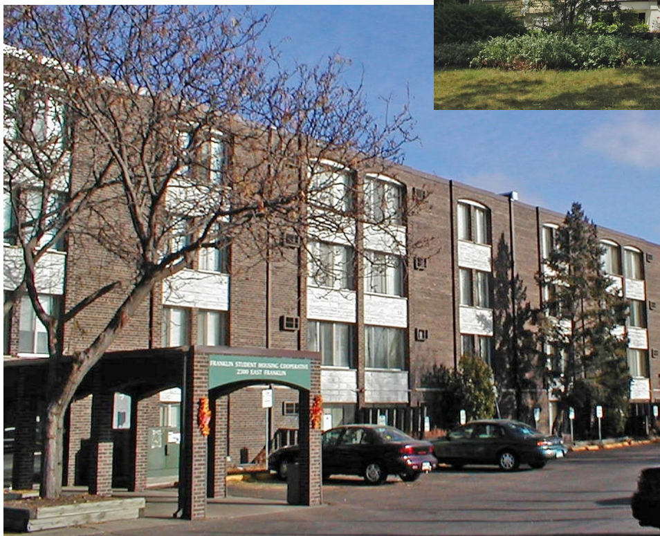
Above: James Russell House is situated in Grand Rapids, Mich. Left: Franklin Student Housing Cooperative is located in Minneapolis, Minn.

As was true during the Great Depression, students turned to self-help, and the campus-based cooperatives were an obvious way to deal with the high cost of housing. Waiting lists grew beyond imagining, and for a few years (1968-74), a U.S. Department of Housing and Urban Development (HUD) program was broadened to assist with the development of new student cooperatives. As my son told me when