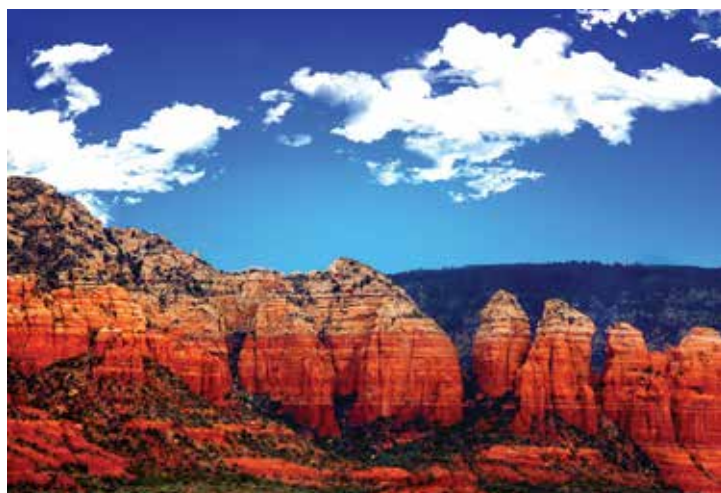
Red Rocks of Sedona

(Note: A minimum of 20 attendees are needed to run this tour.)