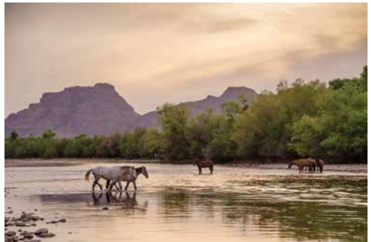
Wild Horses on the Salt River