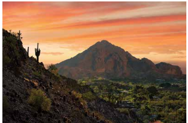
Camelback Mountain at Dusk

Final program available via www.NAHC.coop