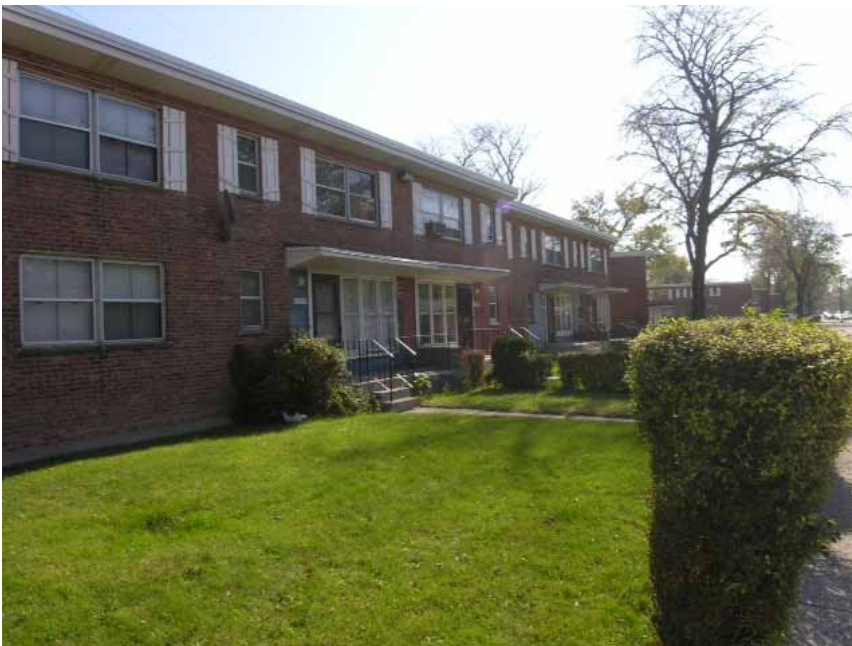
Racine Courts, built in 1950 and converted to co-op in 1968, has stood the test of time.

Fortunately, the cooperative's leadership turned to the Chicago Community Loan Fund, who referred the cooperative's leadership to a consultant who came up with a plan for new management and a loan to begin its rehabilitation. Chicago's Mandel Legal Aid Clinic also stepped in to assist with financial review and an