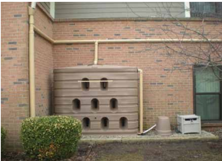
Stormwater retention tank saves roof water for use later in watering lawns and flower beds or hosing down sidewalks.

Co-ops that incorporate environmentally-friendly concepts benefit from lower energy bills and their products are more durable and require less maintenance; overall, green buildings are just considered healthier. They also tend to have fewer vacancies.