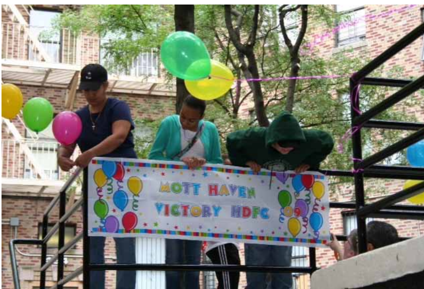
Youth celebrate the opening of Mott Haven Victory Co-op in the Bronx.

With NYCHA stepping away from day to day management, UHAB was appointed as the external monitor of the properties for a period of twenty years. NYCHA also structured "evaporating mortgages" (a forgivable loan) to ensure that the increased costs of a share loan would not thwart the opportunity for full tenant access to the cooperative purchase. A typical two bedroom unit share loan cost $25,000, but a mere $500 out of pocket from the individual NYCHA household. In an unprecedented financial arrangement, NYCHA would amortize the share loan (interest-free, non-recourse) over 20 years,